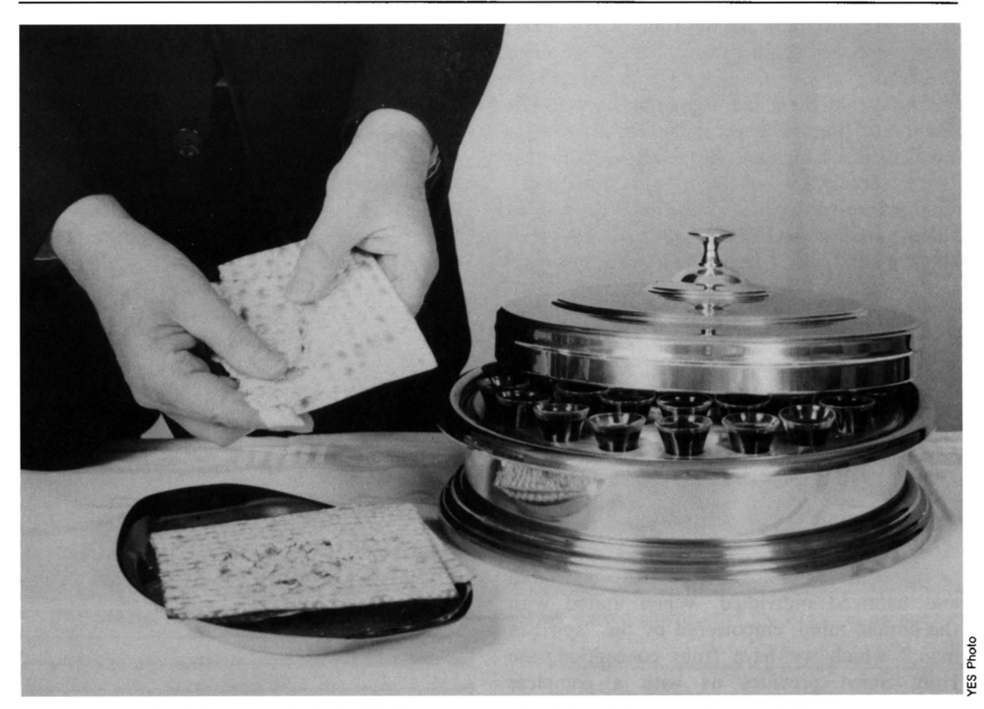
Christ commands that Christians break and eat bread in remembrance of Him.

The agreement on the part of a Christian to obey God's laws and to work hard at living a sin-free life enables God to remit the death penalty. This is called the New Covenant. The Old Covenant was an agreement between God and the people of ancient Israel. It was broken by the Israelites when they rebelled against God. The New Covenant is now between God's true Church (spiritual Israel) and God.