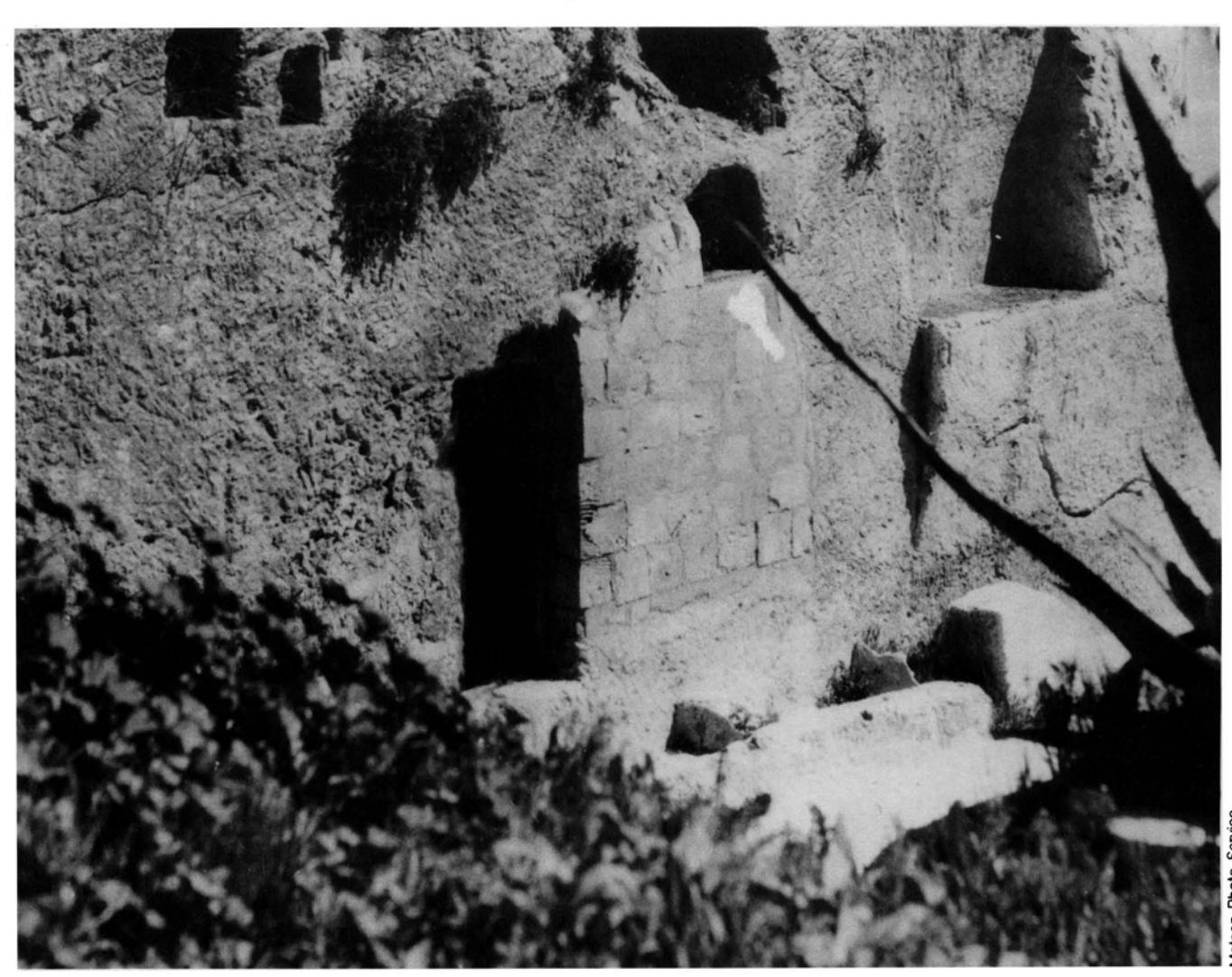
The Garden Tomb is typical of tombs in use at the time of Christ.

Let's notice some other scriptures that show that Christ was to be buried and rise three days