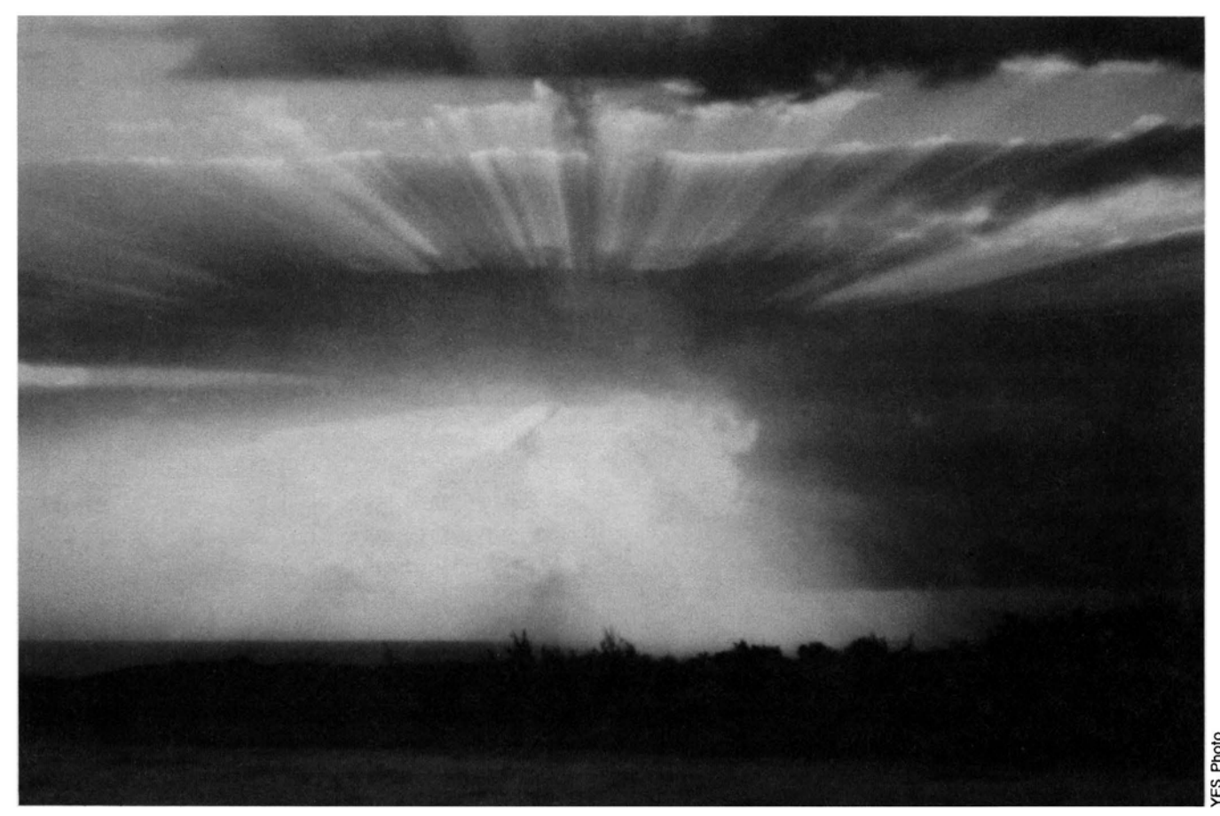
The Bible defines a day as being from sunset to sunset.

Jesus knew that the daylight portion of a day is equal to 12 hours. With three days of 12 hours and three nights of 12 hours, we have a total of 72 hours that Christ had to be in the tomb (John 11:9).